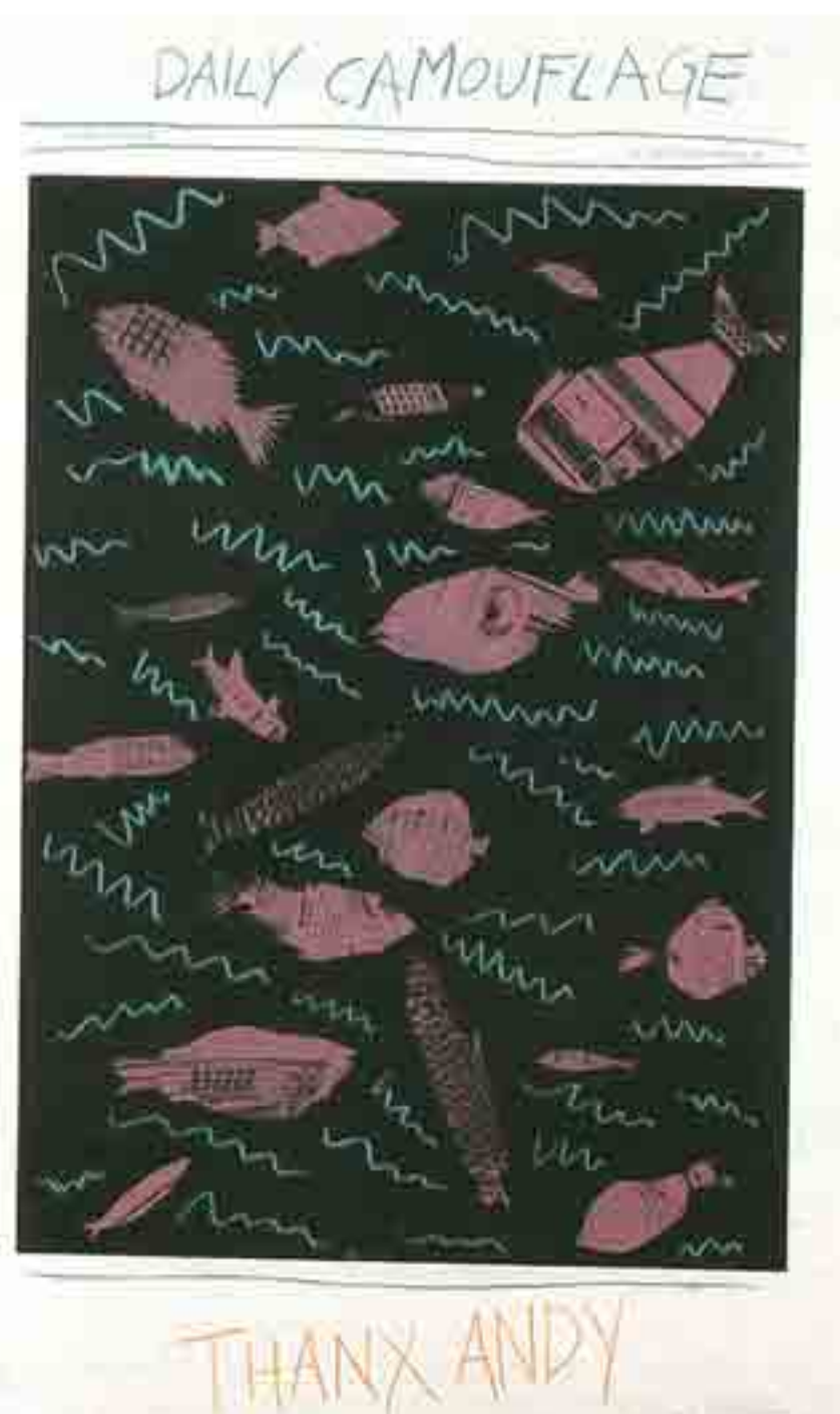
"Thanx Andy," 1988 silkscreen 44" x 30"