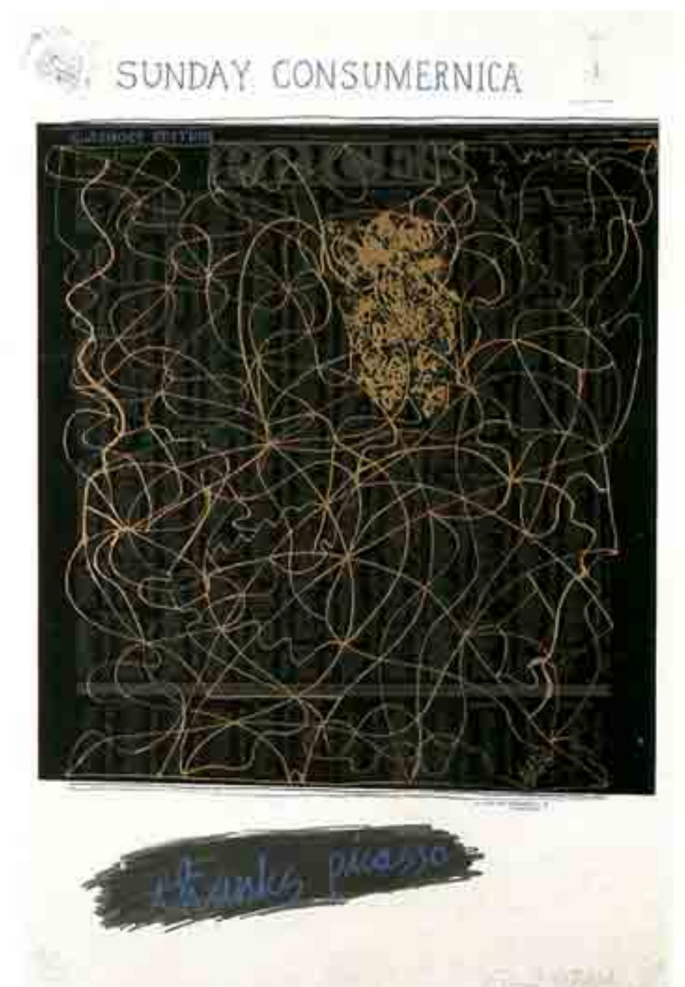
"Thanks, Picasso," 1988 silkscreen 44" x 30"