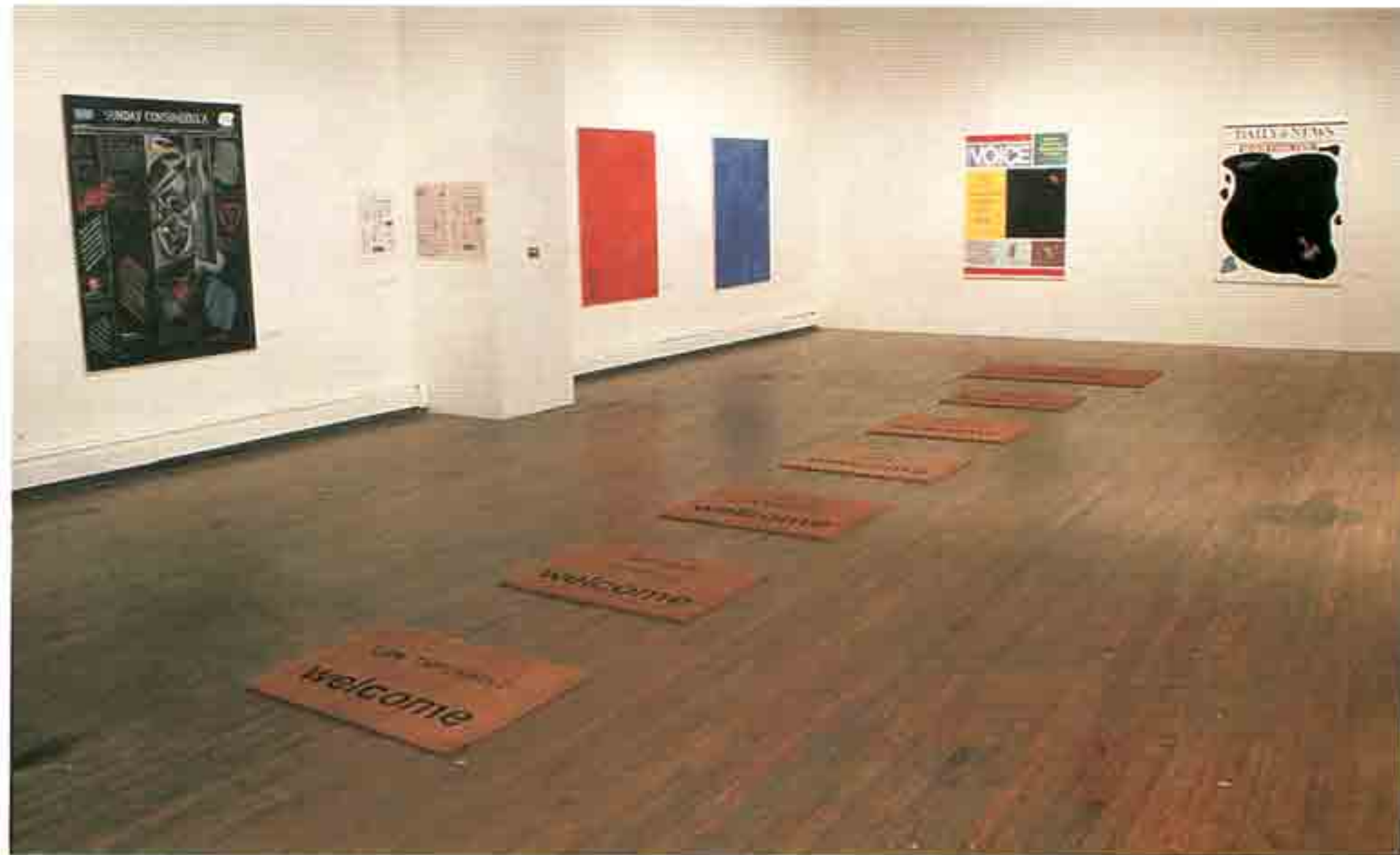
Front Pages Installation View, Feldman Gallery