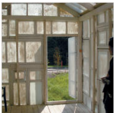
The whitewashed windows are