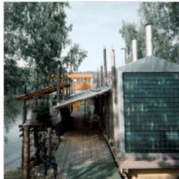
The structure was built based on Brodsky's sketches rather than on formal building plans, and has an estimated area of 3,700 square feet, including open terraces, a covered pavilion, and a glass-and-galvanized steel kitchen.