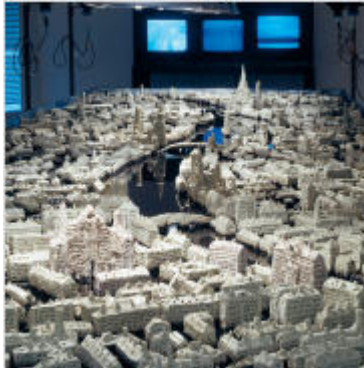
Coma For Coma , Brodsky built a miniature model city--markedly similar to Moscow, where it was displayed--atop a slick of motor oil fed from intravenous tubes.

Pavilion, Brodsky raises one of the tin cups tethered to a nearby table, the interior's sole piece of furniture.