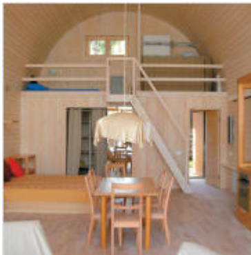
Klyazma House In this lakeside residence, a U-shaped roof creates a high-ceilinged interior.