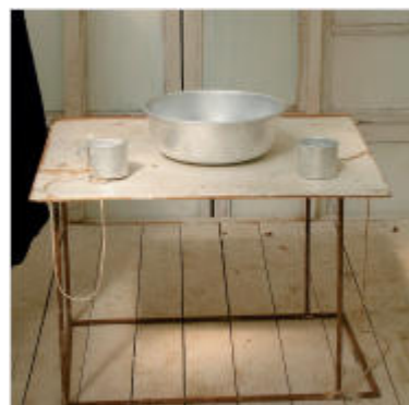
The metal basin holds the