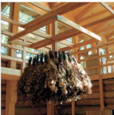
Banya This Russian bathhouse is equipped with birch branches that are slapped and rubbed on bathers to stimulate circulation.

This same philosophy is evident in Brodsky's architectural projects, in particular one of his favorite haunts, Apsu (2002), a restaurant-club hidden in the basement of a nondescript building in Moscow's Zamoskvoreche neighborhood. The space is divided as if it were a Soviet-era communal apartment, and the rooms are framed by windows salvaged from local junkyards. Though it trades on the architecture of the past, there is no hint of kitsch, and it is entirely free of the academicism that characterizes so much postmodern design. "It has this nostalgic feel, but it's not formalistic," Boym says. "His work doesn't have a style--yet because of this narrative, theatrical attitude, it fits very well together. You always enter into a different world with Brodsky."