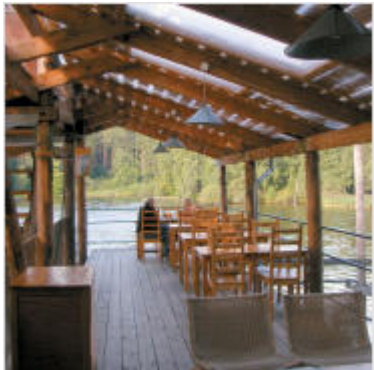
95 Degrees A staggered series of platforms, supported by a network of wooden scaffolding, gives the 95 Degrees restaurant a slightly tilted cantilever over the Klyazma Reservoir.