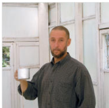
Inside his Vodka Ceremony