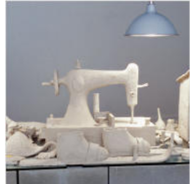
Grey Matter His Grey Matter installation, displayed in New York, featured a collection of dreamlike unfired clay objects, including toy cars, buttons, and a dog watching TV.

pavilion's namesake liquor.