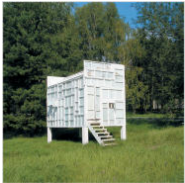
Vodka Ceremony Pavilion Designed in 2004 for the Art-Klyazma festival, the Vodka Ceremony Pavilion cost less than $500 to construct.