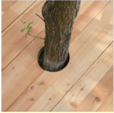
Cutout spaces in the deck and porch roof integrated birch trees into the structure though they were later cut down.