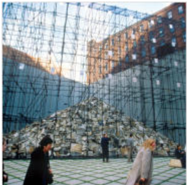
Palazzo Nudo Palazzo Nudo (Nude Palace) , an art project in Pittsburgh, consisted of a five-story-high metal scaffolding surrounding a pyramid of rubble--fragments of the city's demolished historic buildings.