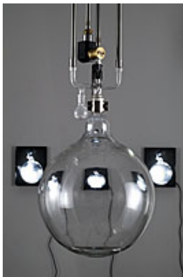
Tavares Strachan Cloud Chamber detail from Glo-Our Rain Maker, 2006 New York City water, New York city dust, mechanical components, computer glass installation: variable dimensions cloud chamber: 11 1/2 inches (approximate diameter)

The work, titled "Components for Absolute Symbiosis", is a reconstruction in delicate, flowing glass tubes of the arteries of the human body, suspended in 300 gallons of mineral oil calculated to make the glass virtually disappear, mesmerizing the viewer with its brief moments of reflection and materialization. All in all, this 1.5 ton piece housed in Plexiglas functions on all levels as an eye-popping, mind-bending collaboration of scientific fact and artistic inspiration.