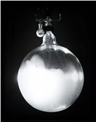
Tavares Strachan Cumulonimbus (calvus) from Cloud Chamber Series 1, 2006 1 of 30 photographs mounted on a lightbox 12 x 9 3/4 inches edition of 3

Strachan's other piece at the gallery, "Glo - Our Rain Maker," occupies the inner room . The main attraction is a suspended glass globe, called the Cloud Chamber, in which the process of cloud formation is replicated in microcosm, in a repeating cycle, using water and silica dust from New York City. Photographic images of various stages of the process in the chamber hang on light boxes on the surrounding walls, completing the installation. The show at Ronald Feldman runs through November 11th, two more of the artists major works are on view at Pierogi in Brooklyn through November 13th.