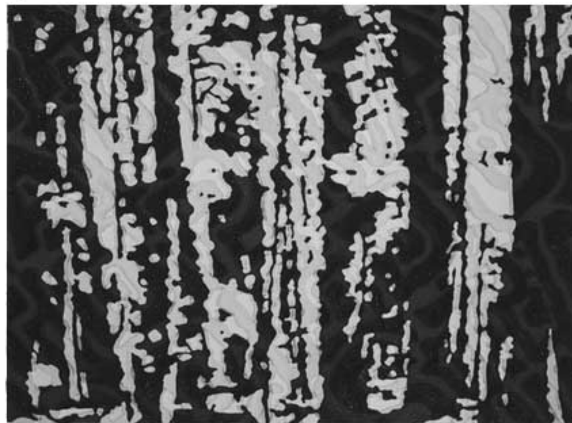
Bruce Pearson, "A Utopia of Dust" (2001), oil and acrylic on Styrofoam 47 1/2 x 64 x 5 1/2 inches.

intensity of the labor, I mean I've developed this kind of idiosyncratic way of working with relief and I've been working this way for over twenty years now. It was just something that happened in order to realize what I wanted to do. So I'm really clueless about how much work is involved.