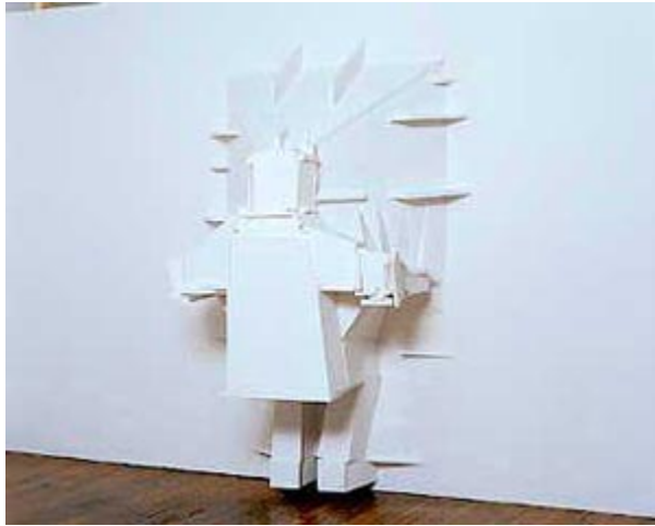
Wall ( I Want to Become Architecture ) , 2002. Sheetrock, plywood, and pine, 108" x 65 1/2" x 36". Convex side.

or perhaps even at an angle, and basically communication is both anarchic and mathematically determined by the diagram of the table itself. Still, the table could be, and of course in our experience is, even larger.