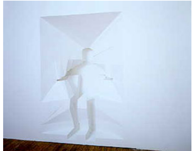
Wall ( I Want to Become Architecture ) . Concave side.

Proposal for Utopian Café (square) , in which the chairs still hold up the canopy but are arranged in the more individualistic mode of Too Large Table .