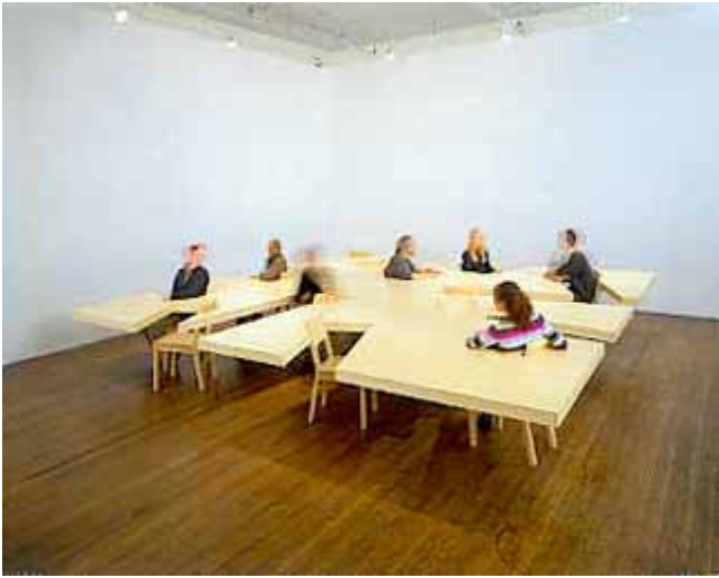
Too Large Table , 2002. Wood and sheetrock, 33" x 192" x 192".

Goddard, Donald. "Allan Wexler: Works." NewYorkArtWorld.com , May 15, 2002.